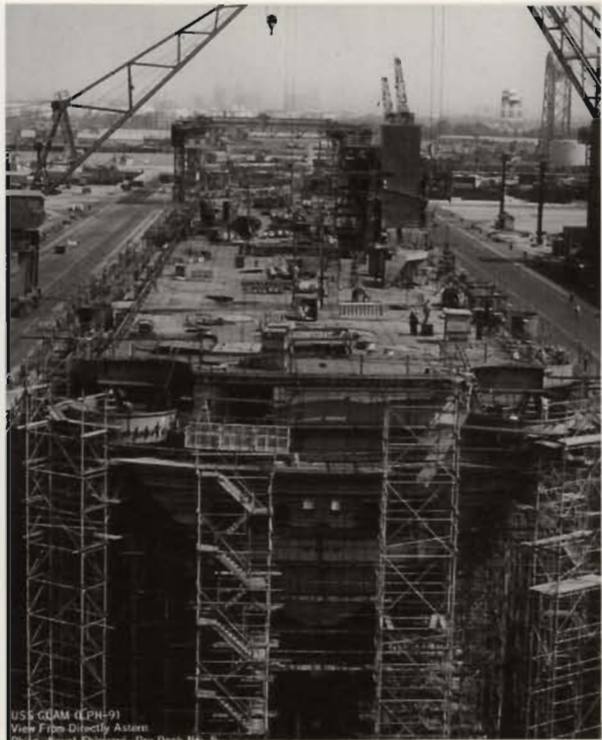
USS GUAM (LPH-9) View From Directly Above